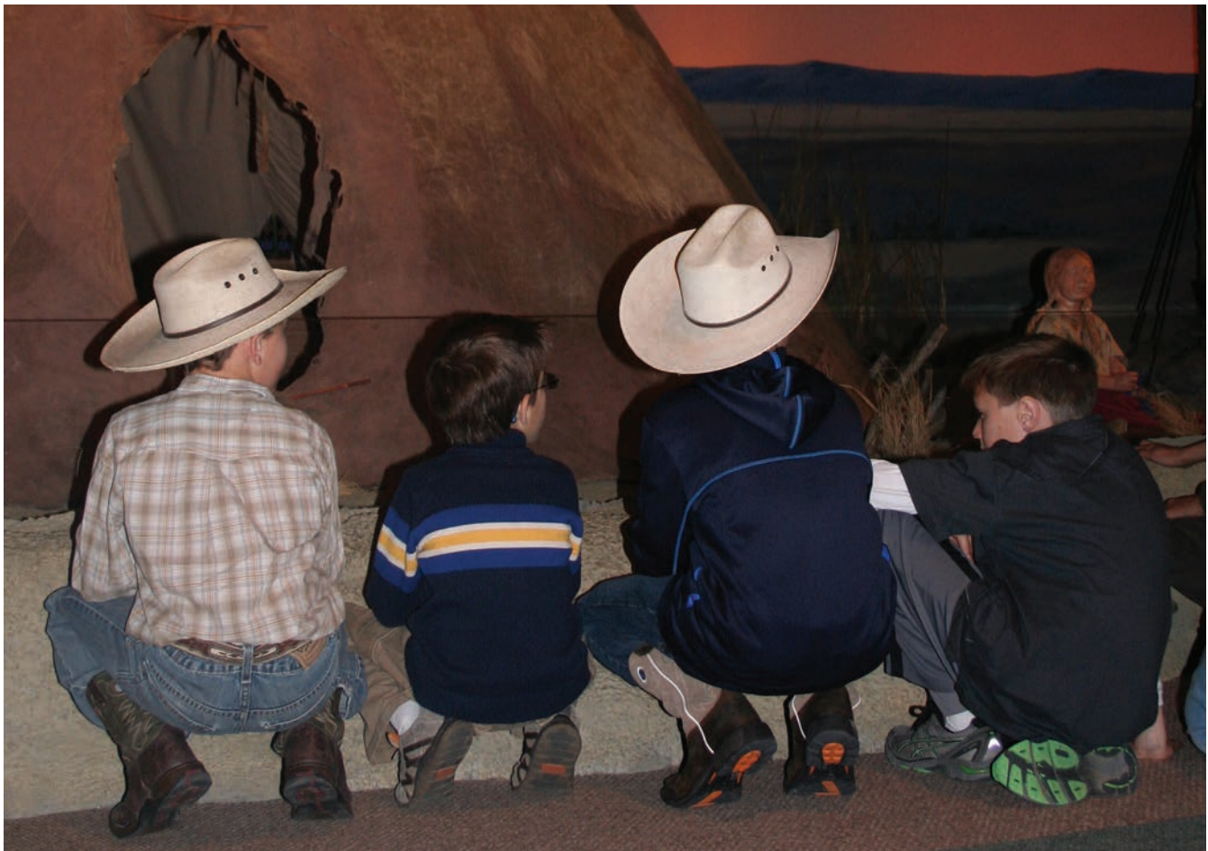
Students enjoying the Seasons of Life exhibit in the Plains Indian Museum as a part of the M.I.L.E.S. program.