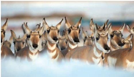
Wyoming's pronghorn.