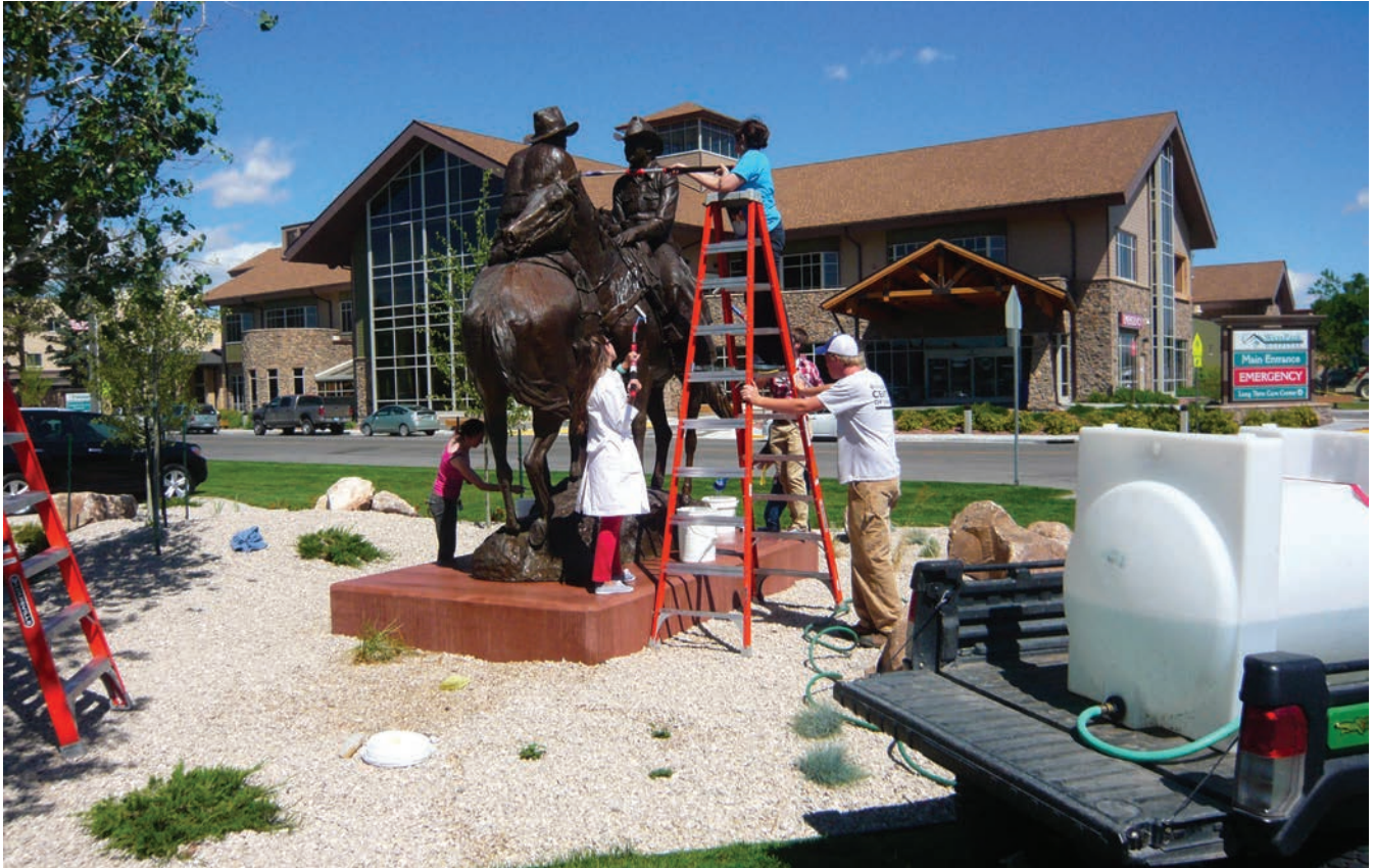
Conservation interns cleaning Herb Mignery's sculpture Code of the West . 9.01