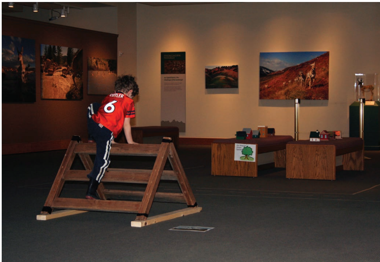
Scaling a “mountain” at Animal Olympics Family Fun Day.