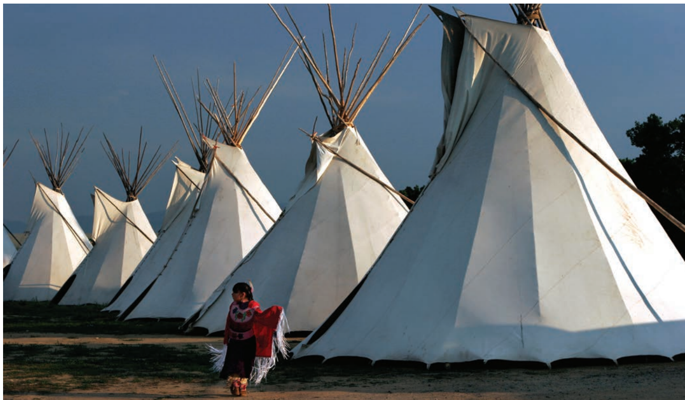
Fort Washakie, Wyoming. 2005.

■ Digitization: The McCracken staff has worked tirelessly behind the scenes to add digital content to the Center’s website. The American Society of Arms Collectors and the Olin Corporation Charitable Trust are important partners in this effort. We also collaborated with administrative staff to create a new brochure about the firearms archival collections. (Goal Three)