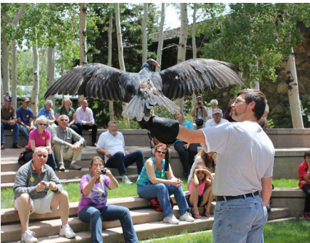
DRAPER MUSEUM RAPTOR EXPERIENCE | daily programs