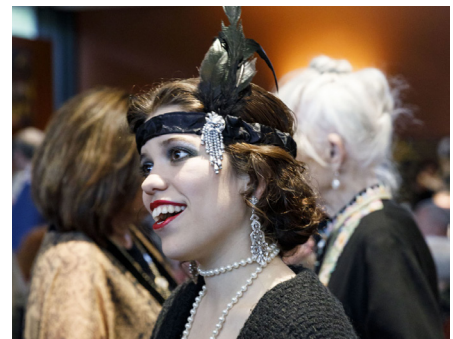
PRIVATE DINING + ENTERTAINMENT