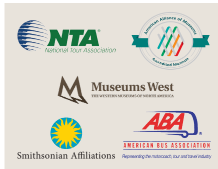
THE CENTER IS A PROUD MEMBER of the above organizations