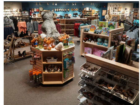
POINTS WEST MARKET we ship on-site & online