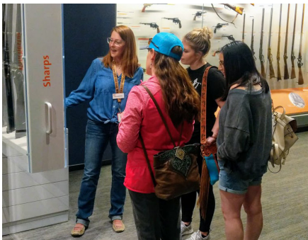
EXCLUSIVE TOURS book a private, expert led tour