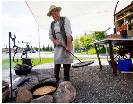
CHUCKWAGON EXPERIENCE lunch & dinner menus available