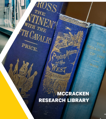
MCCRACKEN RESEARCH LIBRARY