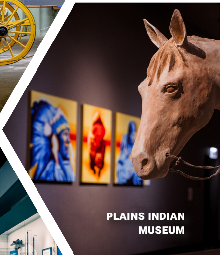
PLAINS INDIAN MUSEUM