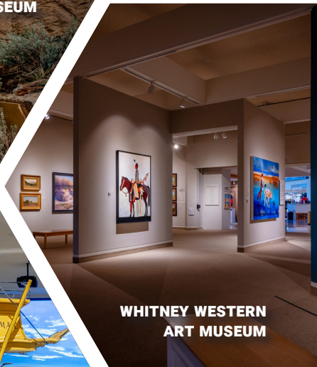
WHITNEY WESTERN ART MUSEUM