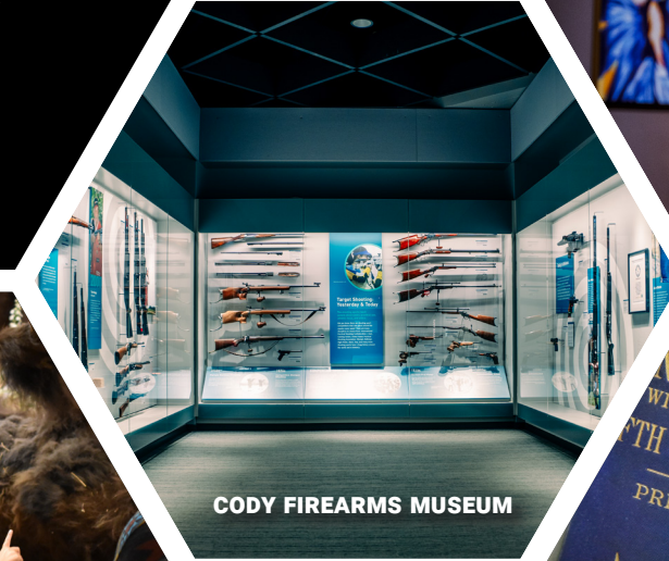
CODY FIREARMS MUSEUM