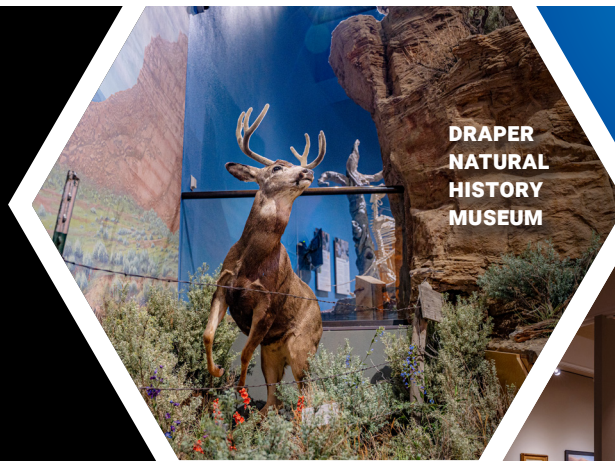
DRAPER NATURAL HISTORY MUSEUM